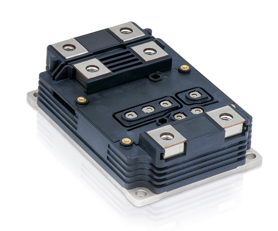
ABB presents a new open standard phase leg module, the LinPak. The innovative LinPak concept answers the market's request for a new package that offers exceptionally low stray inductance and, due to separated phase- and DC-connections, allows for simpler inverter designs. The low-inductive phase leg IGBT module LinPak is available at 1,700 and 3,300 volt.